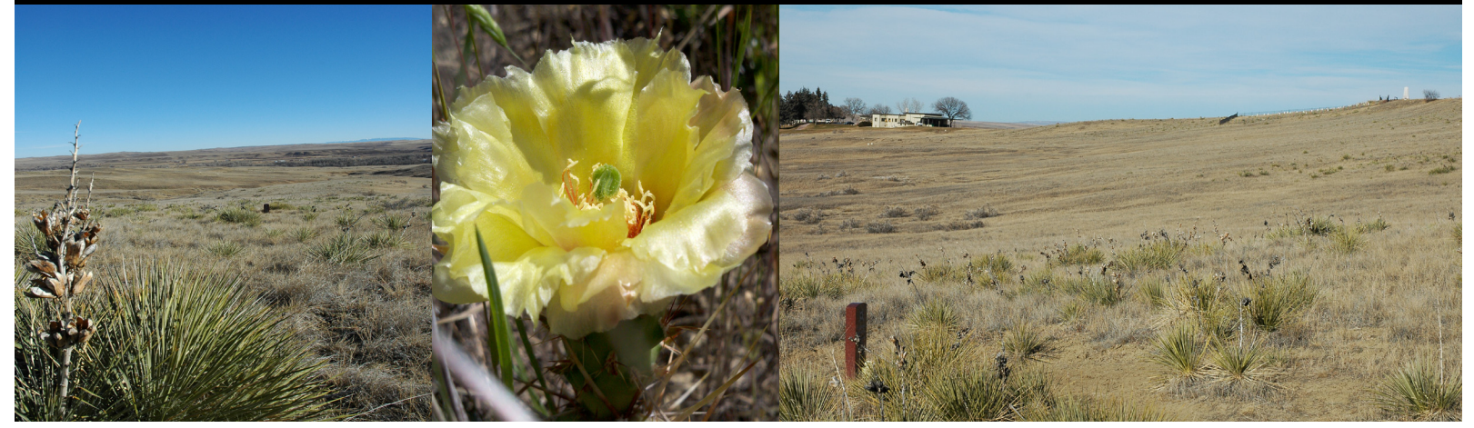
Monument landscape photos by Bob Reece, Friends of the Little Bighorn Battlefield NM. Cactus flower photo by Katie Hester, NPS

We need your help to protect the battlefield! The upland grass prairie of Little Bighorn Battlefield National Monument is relatively undisturbed since the Custer Battlefield was fenced in 1891 and the Reno-Benteen Battlefield in 1954. Despite efforts to protect and maintain a healthy prairie ecosystem, some non-native plant species have taken up residence in the park. In order to maintain native plant diversity, the monument has implemented an Early Detection Rapid Response (EDRR) strategy. The EDRR strategy means locating a potential non-native, invasive plant that is just beginning to invade a particular area and quickly treating the new infestation. This concept is fundamental to effective invasive plant management. Early identification and treatment makes successful control more likely, because it happens before the non-native plant becomes widespread. As a result, it helps to reduce treatment costs. In order to be most effective, EDRR relies upon a strong communication network and education of visitors and neighbors. If you observe a potential invader, please report it to monument staff. Thank you for your cooperation and participation in the EDRR strategy and in keeping the monument free of invasive plants.